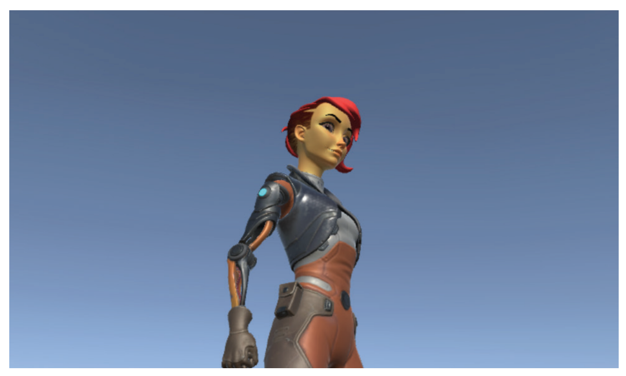
Figure 3: Bottom View