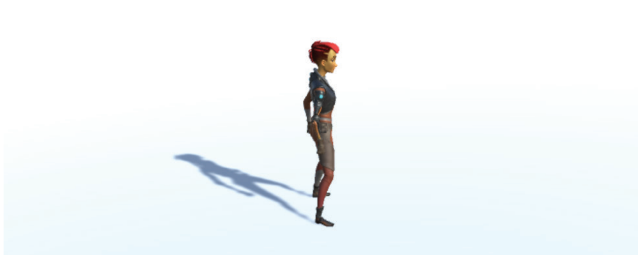
Figure 2: Middle View